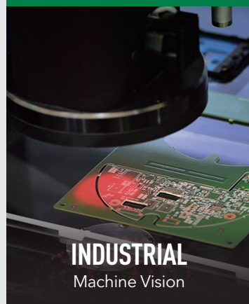
INDUSTRIAL Machine Vision