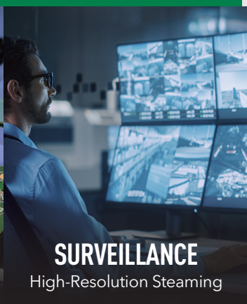
SURVEILLANCE High-Resolution Streaming