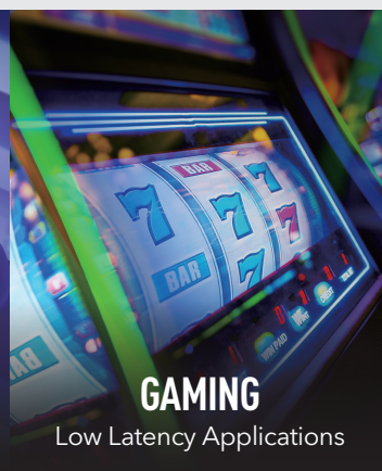
GAMING Low Latency Applications